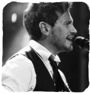
David De María

is a singer songwriter whose career started at 14 with the group Kelliam 71. He release his first solo album at 19. His fifth album, Barcos de Papel, reached triple platinum and confirmed his place among Spain's most successful songwriters with over 1 million albums sold. His latest album is called Séptimo cielo.