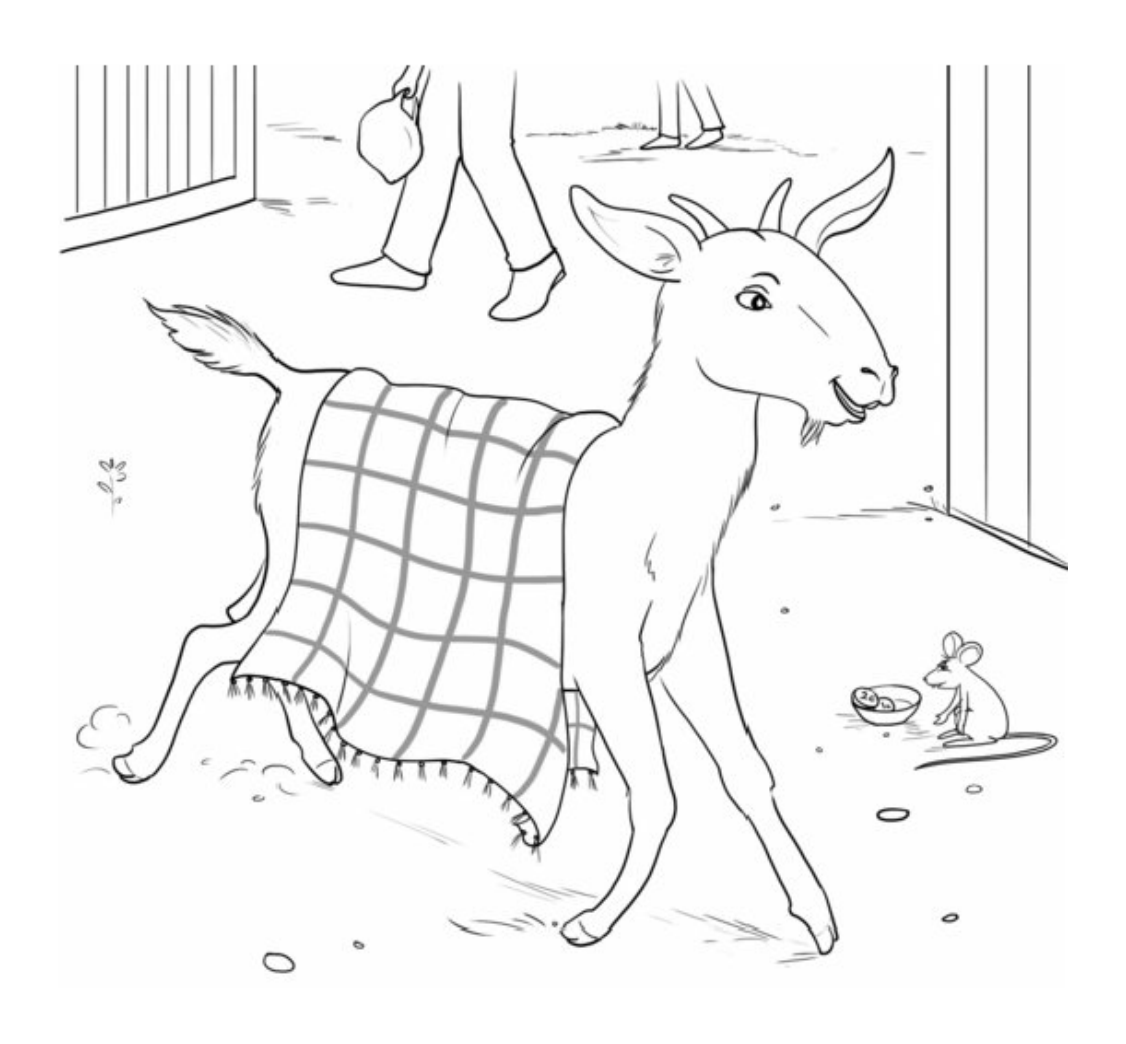
Goat bought a blanket.