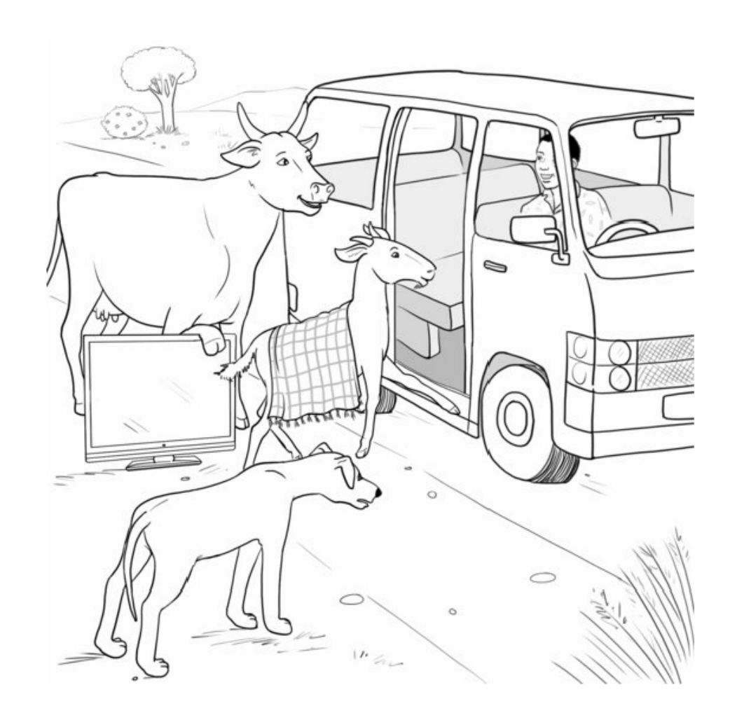
The three friends went home in a taxi.