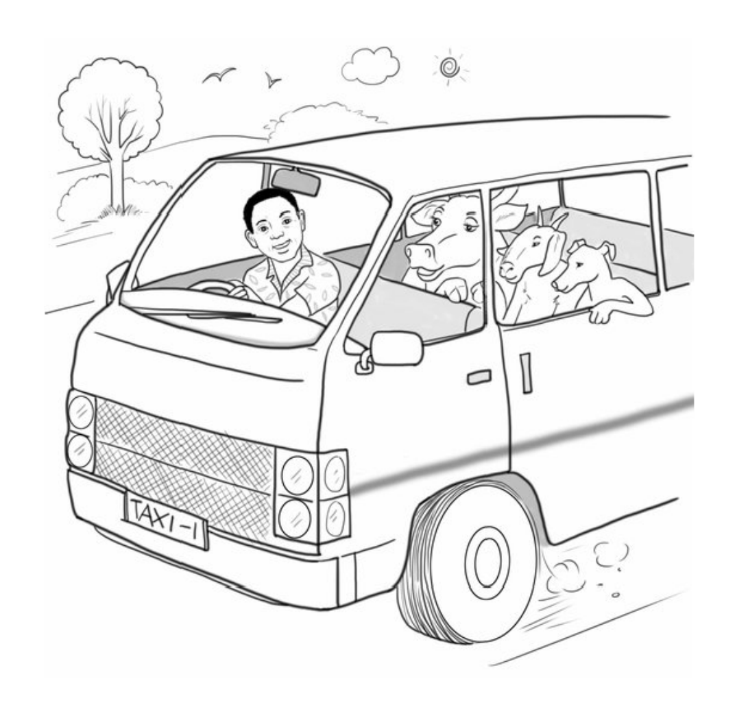
Cow, Goat, and Dog went to town in a taxi. They were going shopping.