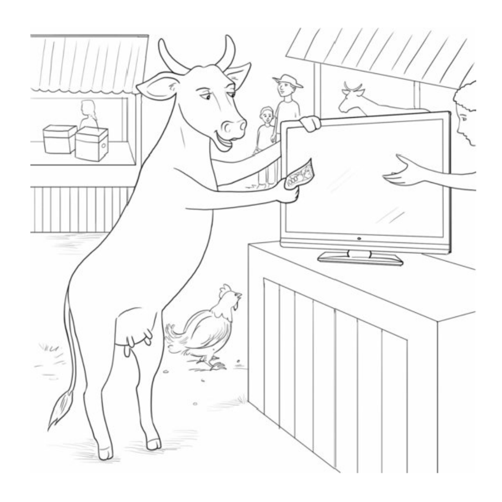
Cow bought a TV.