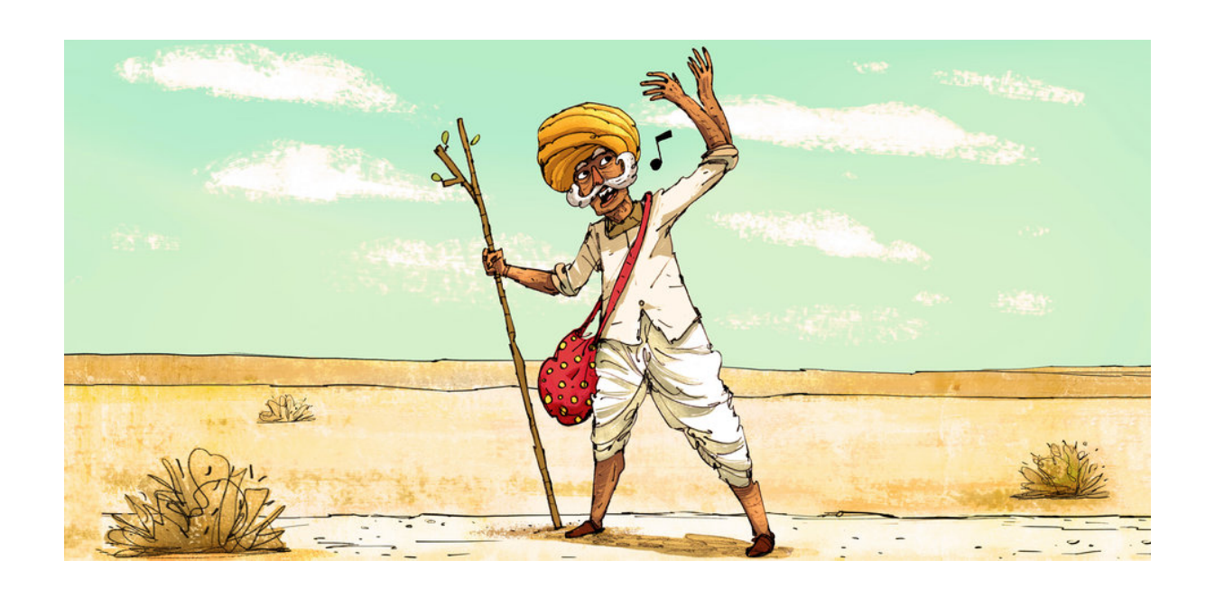
He walks. He sings. His song is: Come to me, clouds!